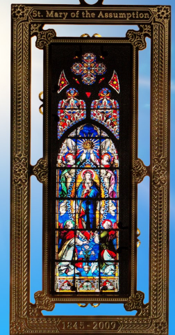
St. Mary of the Assumption