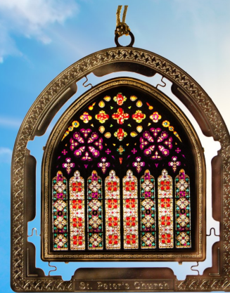
St. Peter's Church