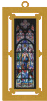
St. Mary's Ornament

There are a few of last year's ornaments still available of the LAST SUPPER WINDOW above the main altar.