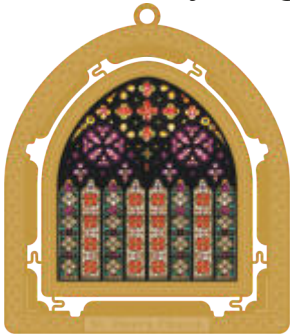
St. Peter's Ornament