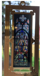
St. Mary's Ornament

There are a few of last year's ornaments still available of the LAST SUPPER WINDOW above the main altar.