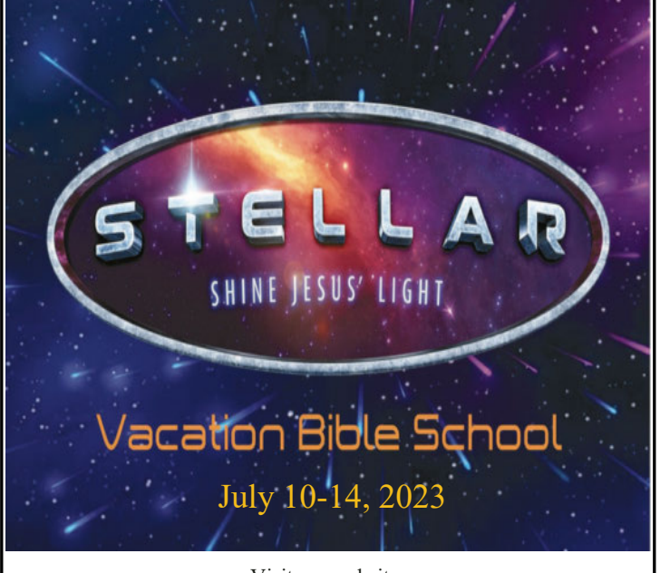
Visit our website: www.smspfaith.com

Sign your child/children up by visiting our faith formation website or by calling the Faith Formation office at 315-336-5066